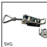
SVG Adjustable latch clamp with strike plate, Stroke from 106,7mm to 121...