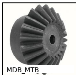
MDB_MTB Moulded plastic bevel gear (nylon), 3:1