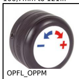
OPFL_OPPM Numerical counter accessories,