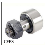
CFES Eccentric cam follower, Eccentric