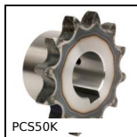
PCS50K Chain sprocket with hardened teeth, 12.7mm (DIN08B-1)