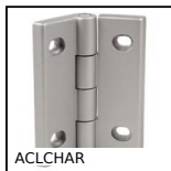
ACLCHAR Hinge for aluminium profile, With elongated holes