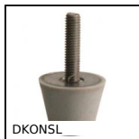
DKONSL Silicone conical elastomeric buffer, Male mounting