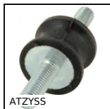
ATZYSS Stainless steel diaboloid shaped elastomeric mount, Stainless steel