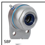
SBF Sealed flange bearing unit for Food Industry, cover