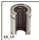
KB_OP Open precision linear bearing, Precision - steel