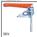
SEV Vertical stirrup toggle clamp, Vertical Latch Clamp - steel