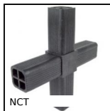
NCT Square tube connector, Fixed angle