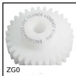
ZG0 Plastic spur gear, Machined plastic (delrin)