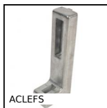
ACLEFS Floor anchor for aluminium profile, Standard