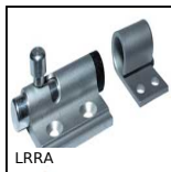
LRRR Latch with locking system, Aluminium