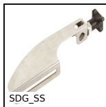
SDG_SS Universal adjustable guide support bracket, Stainless steel