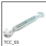
TCC_SS Stainless steel rigging screw (hook/hook), Stainless steel