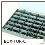
BOX-TOR-C Box set of Nitrile O- rings in nitrile, 3.00 x 1.50mm to 30.20 x 3.00