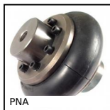
PNA PERIFLEX® elastic coupling, Complete coupling