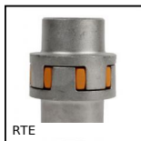
RTE Rotex®, jaw coupling, Aluminium