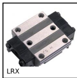
LRX Linear roller slide, Chariot - from 9410 N to 101000 N