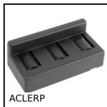
ACLERP Roller block for aluminium profile, With guide rail