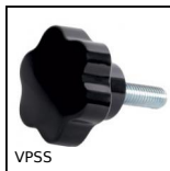
VPSS Small 6 lobe threaded handle - male, Duroplast - Stainless steel