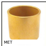
MET Cylindrical sintered bronze bush, Self- lubricating sintered bronze