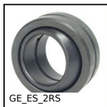
GE_ES_2RS Spherical bushing, Steel / steel with seals