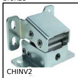
CHINV2 Invisible hinge, Invisible - Opening up to 125°