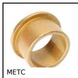
METC Flanged sintered bronze bush, Self- lubricating sintered bronze