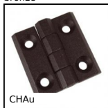
CHAU Screwed hinge, 270°