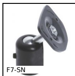
F7-SN Multifunction display, Articulated support