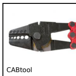
CABtool Fitting cable tools, Crimping tools