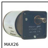
MAX26 Motor-gearbox 12V and 24V DC, from 0,075 to 0,6Nm