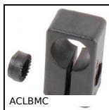
ACLBMC Detector support for aluminium profile,