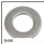
SHW Plain washer, Steel