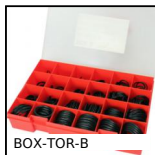
BOX-TOR-B Box set of Nitrile O- rings in nitrile, 20.38 x 1.78mm to 50.16 x 5.34