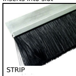
STRIP Sealing brush strip, 3m length