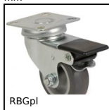
RBGpl Swivel castor with double brake, Steel - grey rubber