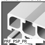
PRF_PSP_PR Dual purpose strip and cover for aluminium profile, Inserts into slot