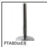
PTA80ssEB Articulated foot with sheet metal base