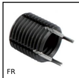
FR Steel thread inserts, Steel