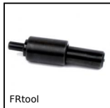
FRtool Tool for thread repair inserts, Assembly tool