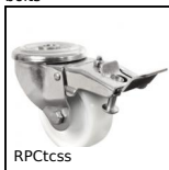
RPCTcss Swivel castor with central hole, Stainless steel - Polyamide - with ...