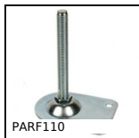
PARF110 Pressed steel base with rigid foot, Swivelling Ø110