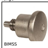
BIMSS Indexing plunger mini, miniature - Stainless steel