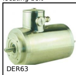
DER63 Stainless steel AC asynchronous motor 0.18 kW, 0.18kW