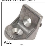
ACL Joints for aluminium profiles, Variable angle corner