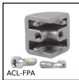
ACL-FPA Panel mounting block for aluminium structures, Angular connector