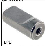
EPE Wing nuts Hygienic Design®, Narrow