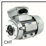
CHT Asynchronous AC Motor 1.1 to 1.85kW, 1.1 to 1.85kW