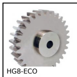
HG8-ECO Eco range Spur gear, Steel C45