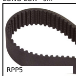
RPP5 RPP heavy duty timing belt, RPP5