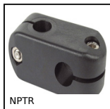
NPTR Adjustable cross clamp, Adjustable