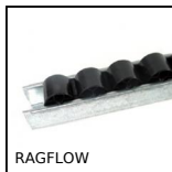
RAGFLOW Floway2® roller track, Roller track