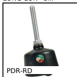
PDR-RD Mounting feet with integrated castors, Offset castor