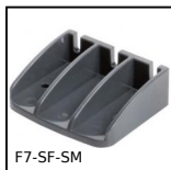
F7-SF-SM Multifunction display, Right angled mounting bracket