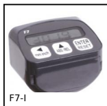
F7-I Multifunction display, With internal sensor