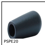
PSPE20 Conical flexible shaft handle Ø20, Black PVC