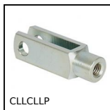
CLLCLLP Clevis components, long version, Steel -