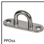
PPOss Pad eye on mounting plate oval, Stainless steel