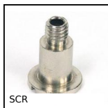
SCR Suction cup threaded insert, Insert for