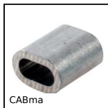
CABma Swaging sleeve for fitting cable, To crimp a wire rope