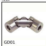
GD01 Double universal joint, Standard duty