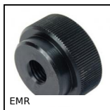
EMR Fast-locking knurled nut, Knurled