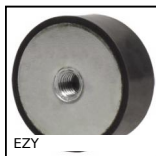
EZY Cylindrical stop, Steel