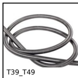
T39_T49 Extension spring in metre length steel, by the metre