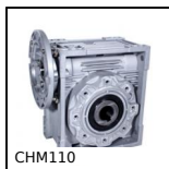
CHM110 Worm and wheel gear reducer, up to 980 Nm