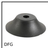
DFG Flat suction cup, nitrile