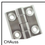
CHAuss Screwed hinge, 270°