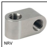
NRV Orthogonal support clamp, Orthogonal support clamp