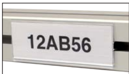
Mounted on a profile