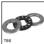
TB8 Cylindrical roller thrust bearing, Steel