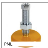
PML Solid foot mount for heavy loads, Ø 100, 120 or 150