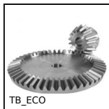
TB_ECO Eco. range steel bevel gear, 3:1