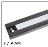
F7-P-AM Multifunction display, Magnetic band