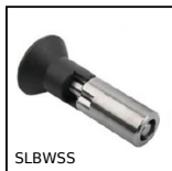
SLBWSS Indexing plunger, weldable, Weldable - Stainless steel