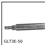
GLT3E-50 Telescopic drawer,