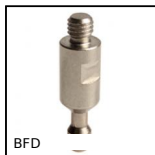
BFD Locking pin for bush, +180°C