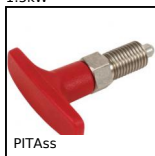
PITAss Locking bolt, with T handle