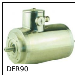
DER90 Stainless steel AC asynchronous motor 1.1 - 1.5kW, 1.1 to 1.5kW