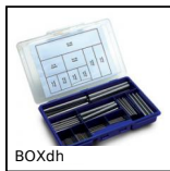
BOXdh Boxed set of cylindrical dowel pins DIN6325, Boxed set - Solid DIN 6...