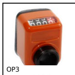
OP3 Mechanical digital position indicator, 4 numbers