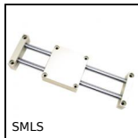
SMLS Linear table, For small lengths