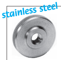
Low version EMS-B