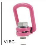
VLBG Lifting ring, Rotating