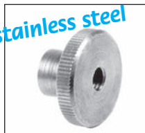
Tall version EMS-H