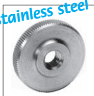
Low version EMS-B