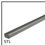
STL Guidance brush - Rail, Rail