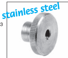
Tall version EMS-H