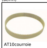
AT10courroie AT type timing belt, AT10 Steel cored polyurethane