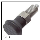
SLB Indexing plunger, stainless steel