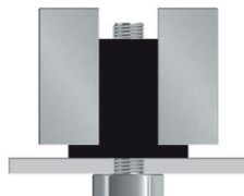
Mounting type 2