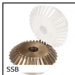
SSB Stainless steel bevel gear, 1:1