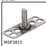
MSP3815 Masterplate® glueable insert rectangular, rectangular with threaded...