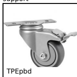
TPEpb Castor for aluminium profile, Swivel with brake