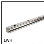
LWH High rigidity linear slide, Rail - from 9320 N to 71300 N