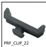
PRF_CLIP_22 Cable clip for aluminium profile, For electric and