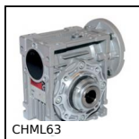
CHML63 Worm and wheel gear reducer, up to 138 Nm - Integrated torque limiter