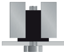
Mounting type 2