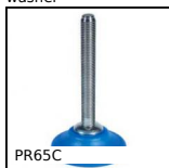
PR65C Half-articulated foot \varnothing 65, \varnothing 65