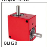
BLH20 Right angled gearbox, from 0.53 to 1.77