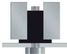
Mounting type 2