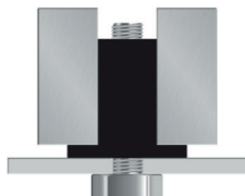
Mounting type 2