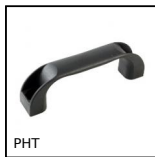
PHT Pull handle, Up to 250 °C