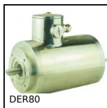
DER80 Stainless steel AC asynchronous motor 0.55 - 0.75kW, 0.55 to 0.75kW