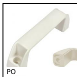
PO Pull handle - Multi-sector, Smooth hole