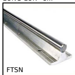
FTSN Supported shaft for linear guide, Steel shaft / Aluminium support