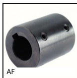
AF Shaft clamp with keyway, Set screw