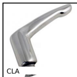
CLA Clamping lever Hygienic Usit® - female, Stainless steel