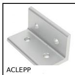
ACLEPP Right angled bracket for aluminium profile, 4 holes