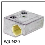
WJUM20 Drylin® W bearing block, Slide