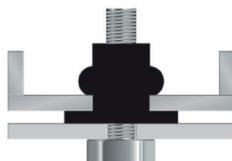
Mounting type 1