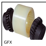
GFX Curved tooth coupling, economy range, Steel and