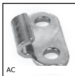
AC Strike for toggle latch, 12mm