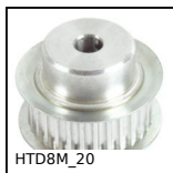
HTD8M_20 HTD Heavy duty timing pulley, HTD8 Cast