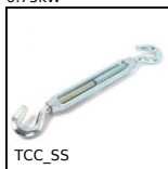
TCC_SS Stainless steel rigging screw (hook/hook), Stainless steel