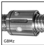
GBMz Cylindrical ballscrew nut, Cylindrical nut - Multiple starts