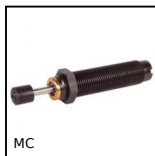
MC Self-compensating shock-absorber, Self- compensating - without adjust...