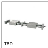
TBD Manual leadscrew table with opposing threads, 20mm guide rods