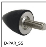
D-PAR_SS Stainless steel elasto mount, stainless steel