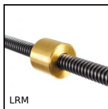
LRM Trapezoidal bronze nut, Bronze - 1 thread