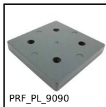
PRF_PL_9090 Joining plate for aluminium profile, Joint plate - 90x90 mm