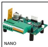
NANO Speed controller 3A, 3 A