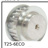
T25-6ECO T type timing pulley, Economy range - T2.5 aluminium