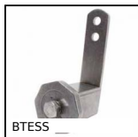
BTESS Universal stainless steel arm for tensioner, For use in hostile envi...