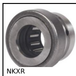
Combined bearing without inner ring, Needle and cylindrical rollers