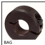
Steel Clamping collar, Steel