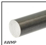
Aluminium shaft for linear guide, Aluminium