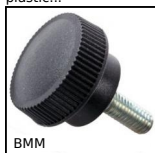
Knurled knob - male, Knurled