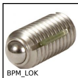
Long-Lok slotted spring plunger with ball tip, LONG-LOK - Stainless ...