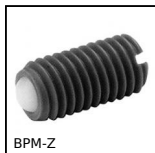
Plastic slotted spring plunger with ball tip, Plastic body + plastic...