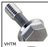
Hexagonal headed screw Hygienic Design®, Stainless steel