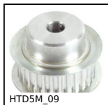
HTD Heavy duty timing pulley, HTD5 Steel