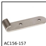
Strike for toggle latch, 25.5mm