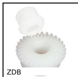
Machined plastic bevel gear , 2:1