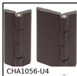
Screwed hinge, 180°