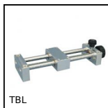
TBL Mini leadscrew table with metric thread, 1kg