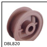
DBL820 Idler for slat top chain, Ranges 820 and 815