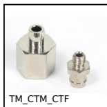
TM_CTM_CTF Suction cup threaded insert, Insert for suction cup - Tread click-in