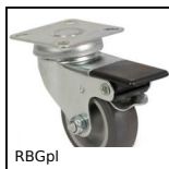
RBGpl Swivel castor with double brake, Steel - grey rubber