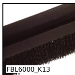
FBL6000_K13 Brush strip per meter PP fibres Ø0.2, Black striated polypropylene