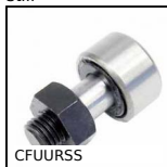
CFUURSS Cam follower stainless steel, Standard - stainless steel