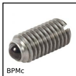
BPM Stainless steel slotted spring plunger with ceramic ball tip, 303 St...