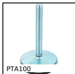
PTA100 Articulated levelling foot, pressed base Ø100, Ø 100