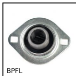
BPFL Sheet steel flanged bearing for light loads, Sheet steel