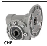
CHB Worm and wheel gear reducer, up to 22 Nm