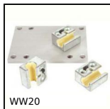
WW20 Drylin® W slide, slide assembly