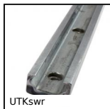
UTKswr Utilitak® V rail, V rail