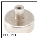
PLC_PLT Magnetic stud with threaded hole, With threaded hole