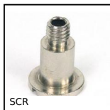
SCR Suction cup threaded insert, Insert for suction cup - Socket screw