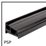
PSP Support profile, Panel support