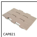
CAP821 Slat top chain acetal, Large range 821