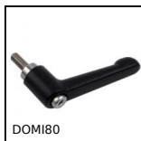
DOMI80 Accessories, Clamping lever