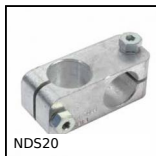
NDS20 Double cross clamp, Crossed