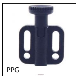
PPG Indexing plunger with flange, With