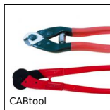
CABtool Fitting cable tools, Cutting tools