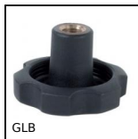
GLB Small 6 lobe female handle, Technopolymer - Stainless steel