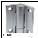
CHAR Spring hinge, screwed