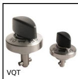
VQT Quarter-turn clamp lock, Plastic or stainless steel button