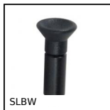
SLBW Indexing plunger, weldable, Weldable - Steel