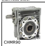
CHMR90 Worm and wheel gear reducer, up to 540 Nm