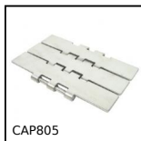
CAP805 Slat top chain stainless steel, Large range 805