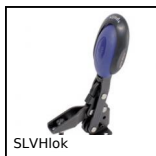
SLVHlok Vertical toggle clamp, Vertical toggle clamp / horizontal foot