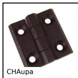
CHAupa Front hinge, 270°