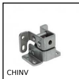
CHINV Invisible hinge, Invisible - Opening up