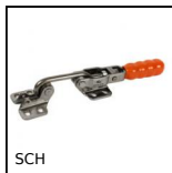
SCH Horizontal hook toggle clamp, Horizontal Hook clamp - stainless steel