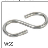
WSS Symmetrical S shaped hook, Steel