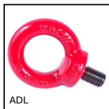
ADL Eye bolt high resistance, alloy steel