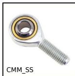
CMM_SS Male rod ends DIN ISO12240-4, Stainless steel / bronze - Economy range