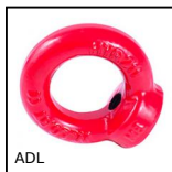
ADL Female eye bolt high resistance, alloy steel