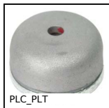
PLC_PLT Magnetic stud with central hole, With