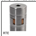
RTE Rotex®, jaw coupling, steel