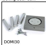
DOMI30 Accessories, Turntable