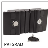
PRFSRAD Dual lock for aluminium profile, Quick fitting, self locking door du...