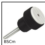
BSCm Knurled torque knobs - male, Knurled threaded torque