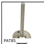
PAT85 Pressed stainless steel articulating foot Ø85, Ø 85