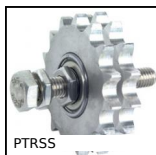
PTRSS Idler chain sprocket, For hostile environments