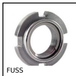
FUSS Bearing locknut, Self locking locknut - stainless steel lock washer