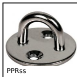
PPRss Pad eye on mounting plate round, Stainless steel