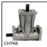
CHTRB Single and dual output gearboxes, Up to 87,3 Nm