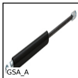
GSA_A Adjustable gas spring, Steel