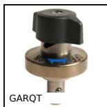
GARQT Quarter turn lock pin for clamping, Quarter turn