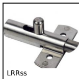
LRRss Latch, Spring loaded latch - stainless steel