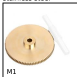
M1 Worm and wheel set, Bronze