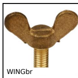
WINGbr Wing screw, hand tightened DIN316, Brass DIN 316