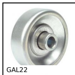
GAL22 Conveyor wheel, Zinc plated steel