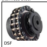
DSF Slip friction clutch, 4 to 2600 Nm