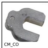
CM_CO Tools Hygienic Usit® and Hygienic Design®, Protective inserts for ...