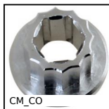
CM_CO Tools Hygienic Usit® and Hygienic Design®, Protective inserts for ...