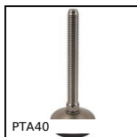
PTA40 Articulated foot with solid base foot Ø 40, 3000N