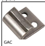
GAC Lock for latch clamp, Strike plate