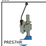
PRES7HR Manual workbench press, Force up to 700kg