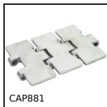
CAP881 Side flexing slim slat top chain stainless steel, Narrow range 881