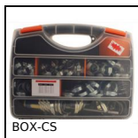
BOX-CS Hose clamp, Box set of steel hose clamps