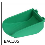
BAC105 Storage bin, 8mm