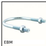
EBM Steel U bolt, Steel