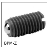
BPM-Z Plastic slotted spring plunger with ball tip,