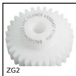
ZG2 Plastic spur gear, Machined plastic (delrin)