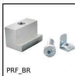
PRF_BR Clamp for aluminium profile, Clamp for