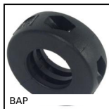
BAP Plastic clamping collar, Ø10 - Ø20