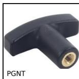
PGNT Thermoplastic T handle, With threaded insert