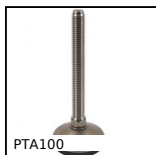
PTA100 Articulated levelling foot, pressed base Ø100, Ø 100