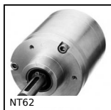
NT62 Spur gear coaxial gearbox, from 6 to 18 Nm - In-line