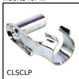
CLSCLP Clevis components, short version, Steel - Short range