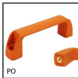
PO Pull handle - Multi-sector, Tapped recessed insert