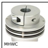
MHWC Double-disc flexible coupling, Double disk