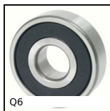
Deep groove ball bearing, Steel