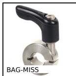
Split shaft collar with clamp lever, Stainless steel