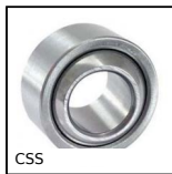
Spherical bushing, Steel / self lubricating steel