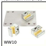
Drylin® W slide, slide assembly