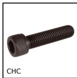
Socket headed screw, Steel class 12.19