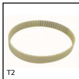
T type timing belt, T2.5 Steel cored polyurethane