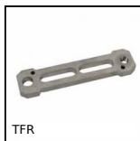
TFR Rigid manual tensioner, Fixed