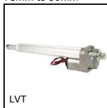
LVT Miniature motorised actuator 1A, 1 ampere