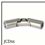
JCDss Double universal joint - Stainless steel, Low duty