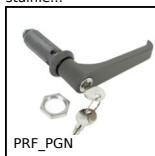
PRF_PGN Door handle for aluminium profile, Handle with lock