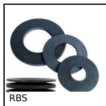
RBS Dynamic washer DIN2093, Steel