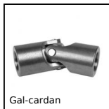
Gal-cardan Single universal joint eco series, Low duty