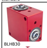
BLHB30 Right angled gearbox, bored shafts, up to 4.4 Nm