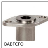
BABFCFO Ball pin socket, Mounting collar with a oval flange