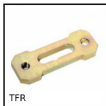
Rigid manual tensioner, Fixed