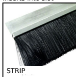
Sealing brush strip, 3m length