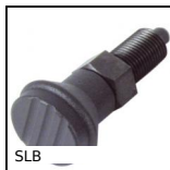
Indexing plunger, steel class 5.8