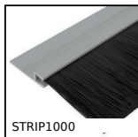
Sealing brush strip, 1m length