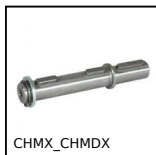
Shaft for worm and wheel reducer CHMR and CHM, CHMR and CHM gearbox...