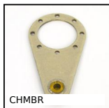
Reaction arm, CHM and CHMR gear reducers reaction arm