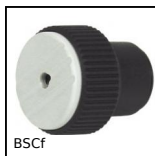
Knurled torque knobs - female, Knurled