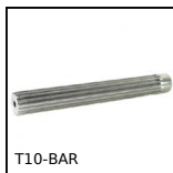
T type tooth bar stock, T10