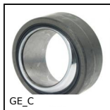
Spherical bushing, Hard chromium / PTFE