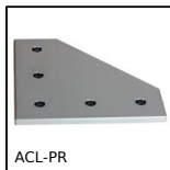
Joining plate for aluminium profile, Right angled connection