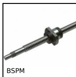
Miniature ballscrew, Nut+rolled ballscrew