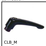
Die cast zinc clamping lever - female, Zamak