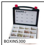
BOXINS300 Box set of self tapping inserts, Boxed set - For hard materials