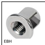
EBH Cap nut Hygienic Design®, With collar