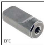
EPE Wing nuts Hygienic Design®, Narrow