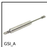
GSI_A Stainless steel adjustable gas spring, Stainless steel