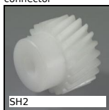
SH2 Parallel axis helical gear, Machined plastic (delrin)