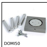
DOMI50 Accessories, Turntable