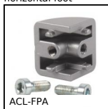
ACL-FPA Panel mounting block for aluminium structures, Angular connector