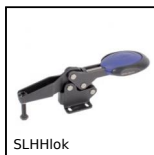
SLHHlok Horizontal toggle clamp, Horizontal toggle clamp / horizontal foot