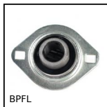
BPFL Sheet steel flanged bearing for light loads, Sheet steel