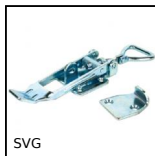
SVG Adjustable latch clamp with strike plate, Stroke from 174mm to 190mm