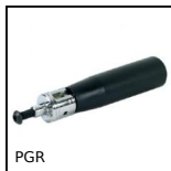
PGR Folding revolving handle for handwheel,