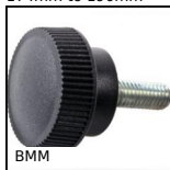
BMM Knurled knob - male, Knurled