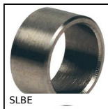
SLBE Indexing plunger - Spacer, for SLB and SLBS index bolts