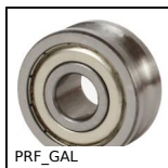
PRF_GAL Roller for aluminium profile, Hollow roller ø12