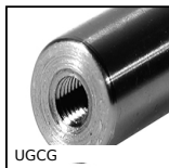
UGCG Actuator guide kit, Long housing