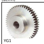
YG1 HEAVY DUTY spur gear, Steel 35NCD6