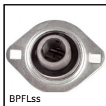
BPFLss Pressed stainless steel flange bearing, Stainless steel