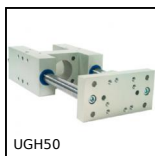
UGH50 H Type Guide units, For Ø50 actuators