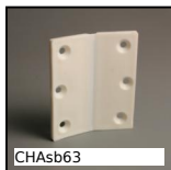
CHAsb63 Hinge without pin, Polymer pin hinge