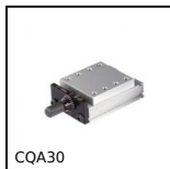
CQA30 Adjustment slide- system miniature, 30