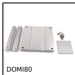
DOMI80 Accessories, Plate