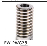
PW_PWG25 Worm - precision range, Steel