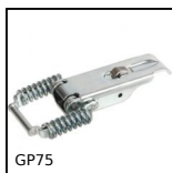
GP75 Spring loaded toggle latch, Standard