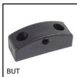
BUT Panel stop, Panel stop