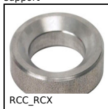
RCC_RCX Spherical tilt washer - DIN6319, concave