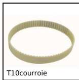
T10courroie Closed belt, T10 Steel cored polyurethane