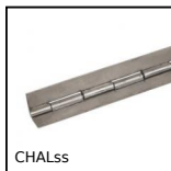
CHALss Piano hinge, Stainless steel