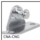
CNA-CNG Gas spring, Right angled mounting plate for clevis