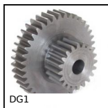
DG1 Double spur gear, Steel 20NCD2