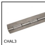
CHAL3 Piano hinge, Steel