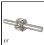
DT Pinion shaft, Steel 20NCD2