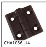
CHA1056_U4 Screw-in hinge, Section 40X40