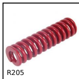
R205 Die spring ISO10243, Heavy