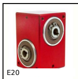
E20 Right angle helical reducers, from 0.60 to