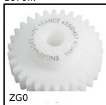
ZG0 Plastic spur gear, Machined plastic (delrin)