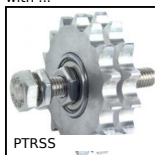
PTRSS Idler chain sprocket, For hostile environments