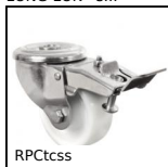
RPCtcss Swivel castor with central hole, Stainless steel - Polyamide - with ...