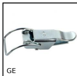
GE Toggle latches, Standard