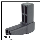
NCT Square tube connector, Fixed angle