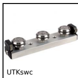
UTKswc Utilitrak® 3 wheels carriage, Series V precision steel wheel