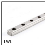
LWL Linear ball slide - Stainless steel balls, Rail - from 514 N to 1670...