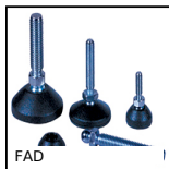
FAD Threaded swivel feet, Swivel feet without anti-slip plate