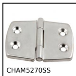
CHAM527055 Marine hinge for welding/screw mounting, Marine