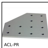
ACL-PR Joining plate for aluminium profile, Right angled connection