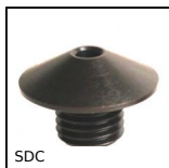
SDC Positioning sleeve for indexing pin, For pin Ø4 to Ø12