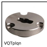
VQTplqn Quarter-turn clamp lock - Clamping plate, Flush mounting