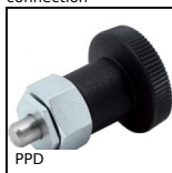
PPD Indexing plunger for sheets, For sheet metal