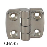
CHA35 Hinge for aluminium profile, Hinge