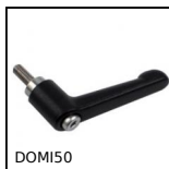
DOMI50 Accessories, Clamping lever