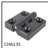
CHA135 Screwed hinge, 135 degrees