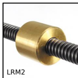
LRM2 Cylindrical bronze nut, Bronze - 2 threads