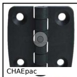
CHAEpac Square decorative screwed hinges, carbon fibre reinforced