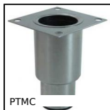
PTMC Telescopic furniture foot, square plate