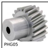
PHG05 Parallel axis helical gear - Precision range, 20NCD2 case hardened s...