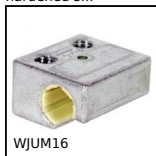
WJUM16 Drylin® W bearing block, Slide