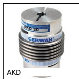
AKD Bellows coupling Gerwah®, from 22 to 600Nm