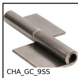
CHA_GC_9SS Stainless steel garnet hinge, To be welded