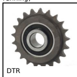
DTR Chain idler sprocket, Chain idler sprocket - Plastic