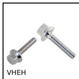
Hexagonal headed screw with collar Hygienic Usit®, Stainless steel