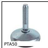
Articulated levelling foot, pressed base Ø50, 4000N