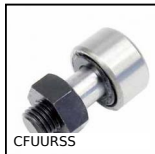
Cam follower stainless steel, Standard - stainless steel