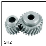
Parallel axis helical gear, Steel 20NCD2