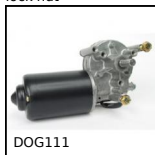
Motor-gearbox 12V and 24V DC, from 1.5 to 6 Nm