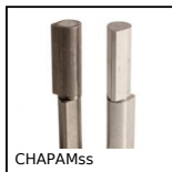
Weld-on hinge with flat end, Stainless steel or Aluminium