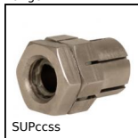
Self-centering clamping hub stainless steel, With lock nut