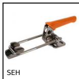
SEH Horizontal stirrup toggle clamp, Horizontal Latch clamp - stainless ...