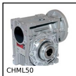
Worm and wheel gear reducer, up to 107 Nm - Integrated torque limiter