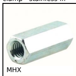
MHX Hexagonal threaded sleeve, Hexagonal - steel