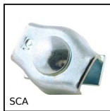
SCA Flat cable clamp, Steel