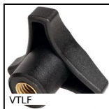
VTLF 3 lobed handle, Polyamide - Brass