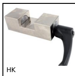
HK Manual locking clamp, Manual locking clamp