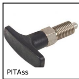
PITAss Locking bolt, with T handle