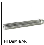
HTD8M-BAR HTD type tooth bar stock, HTD8