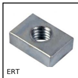
ERT Sliding nut, For T slot