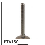
PTA150 Articulated levelling foot, pressed base Ø150, Ø 150