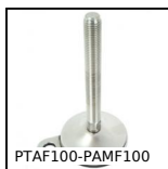
PTAF100-PAMF100 Articulated fixable foot with pressed base Ø100, Ø 100